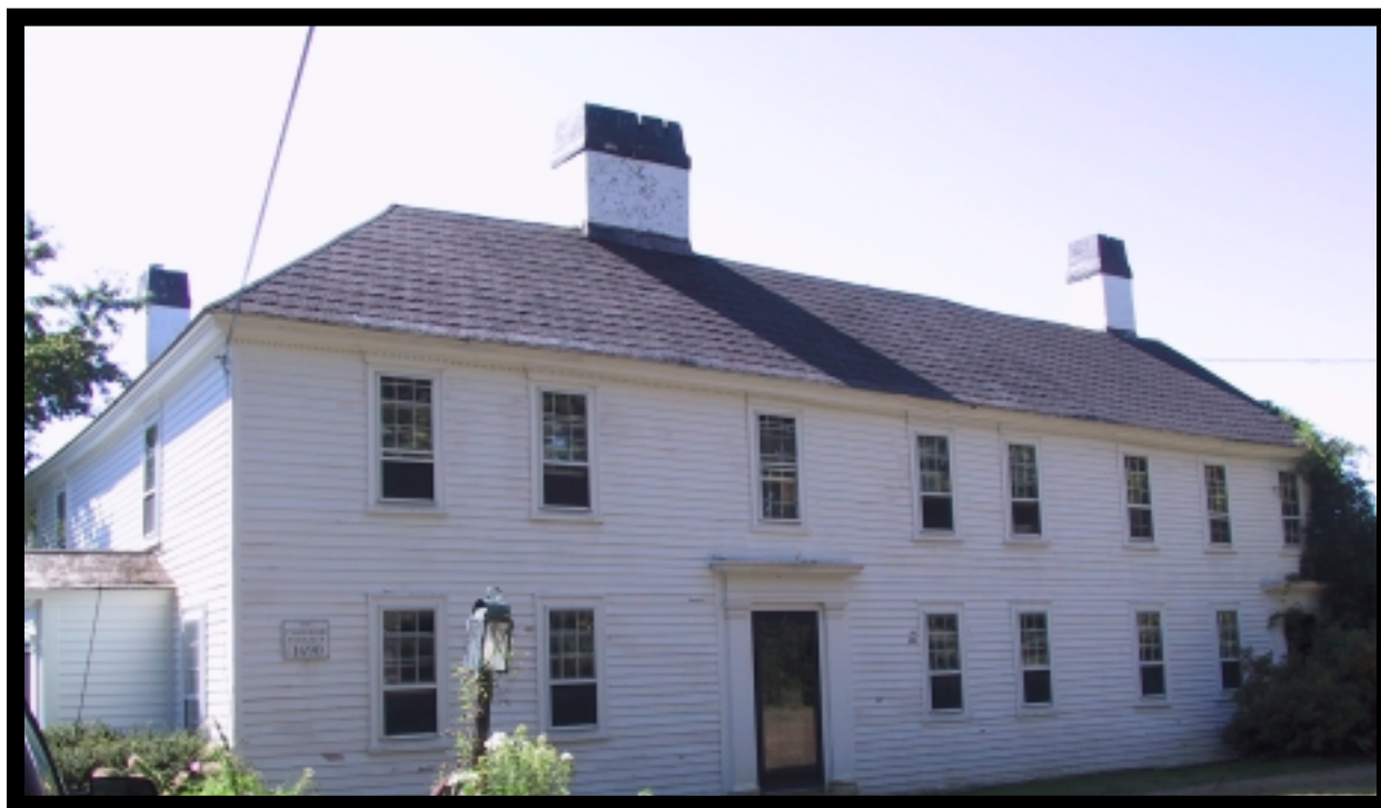
Main house of the Old Tyler Homestead—now known as Witch Hollow Farm.