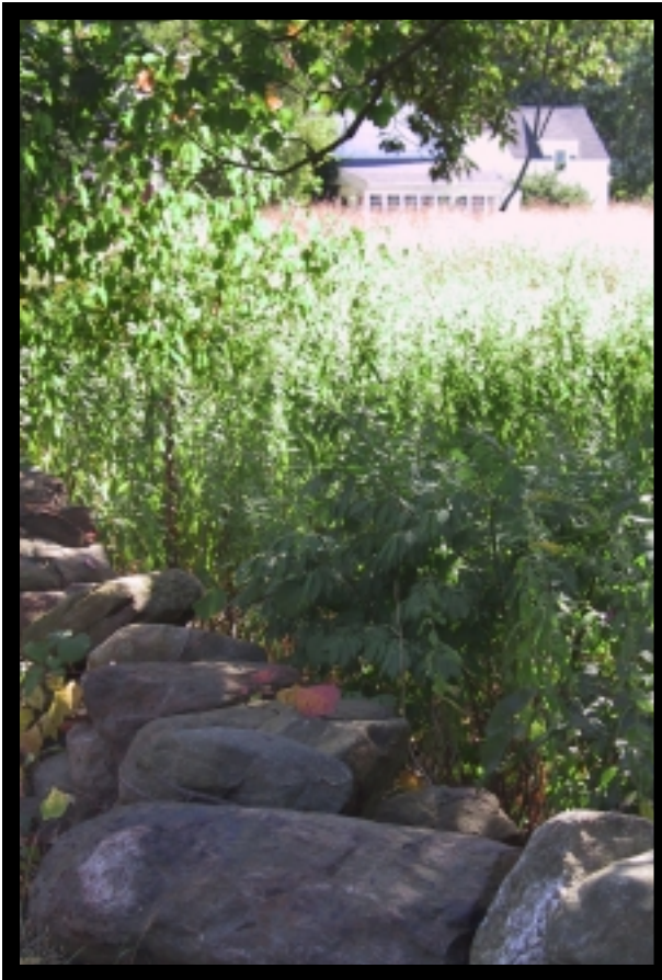
The main house of the Old Tyler Homestead in West Boxwood, Massachusetts. Photo 9/11/01